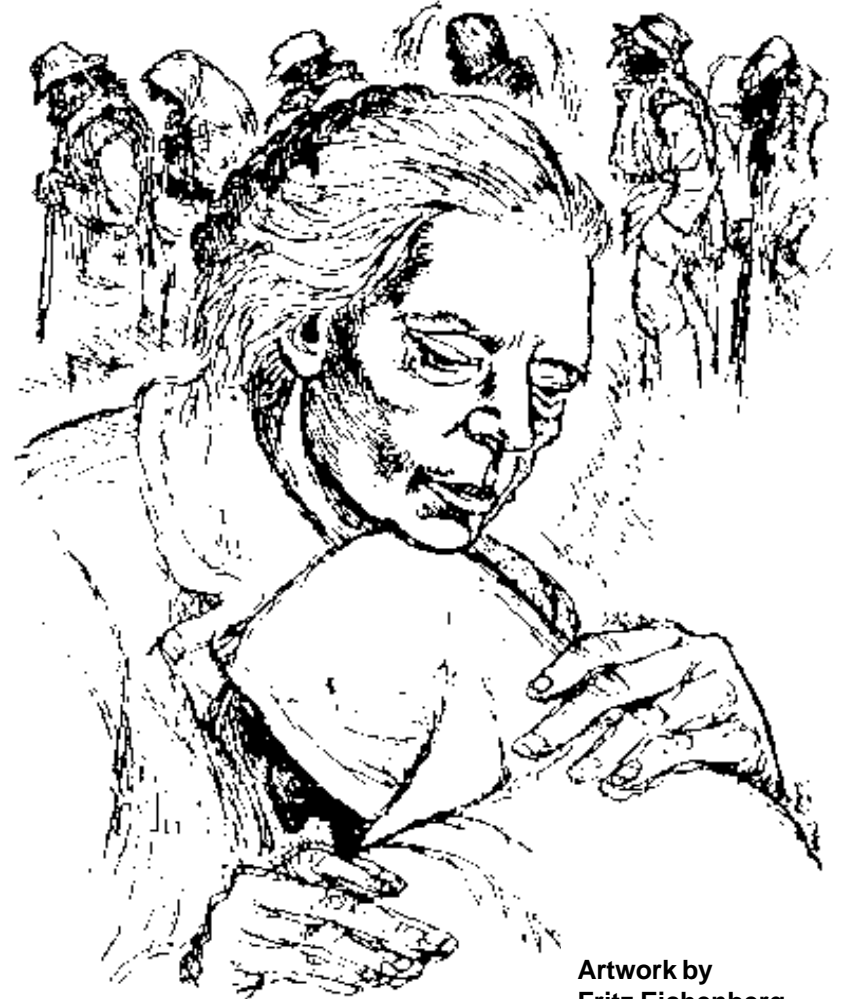
Artwork by Fritz Eichenberg