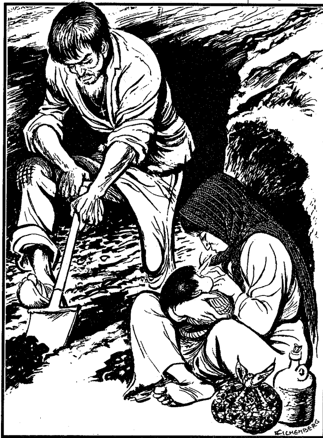
HOLY FAMILY, FARMWORKERS (1954) ENGRAVING BY FRITZ EICHENBERG