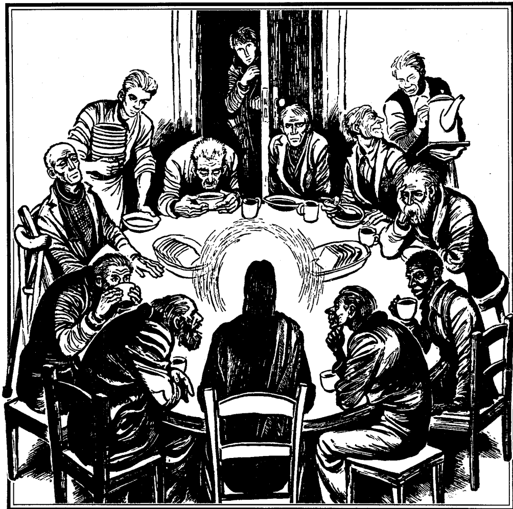
THE LORD'S SUPPER BY FRITZ EICHENBERG (1953)

Here at the Las Vegas Catholic Worker we struggle to form community modeled after the early Christians. Since the founding of the Las Vegas Catholic Worker almost ten years ago, many people have