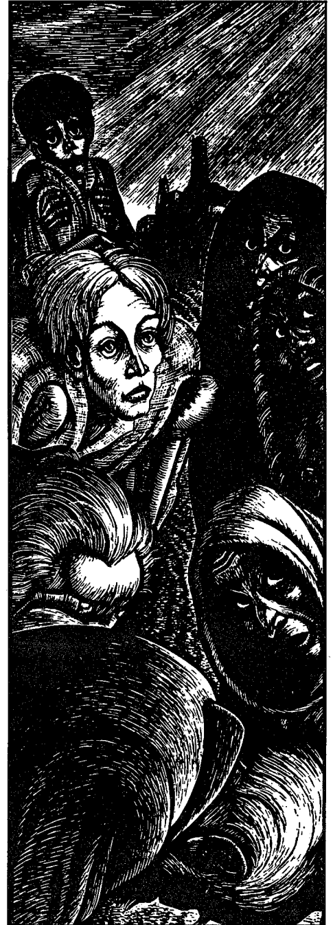
THE LIGHT BY FRITZ EICHENBERG

I pray that we may all continue to be open to the new life within, to the changing of our own clocks so that we may see "the light" more often.